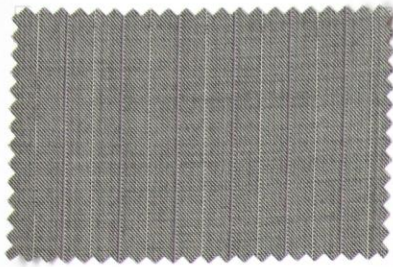
066-97 / 700 2% SILK 98% WOOL PRESTIGE 150 150 CM 260 G GREY / SUIT