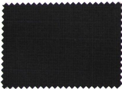
067-64 / 700 2% SILK 98% WOOL PRESTIGE 150 150 CM 260 G CHARCOAL / SUIT