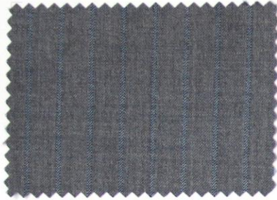
060-57 / 700 2% SILK 98% WOOL PRESTIGE 150 150 CM 260 G BLUE / SUIT