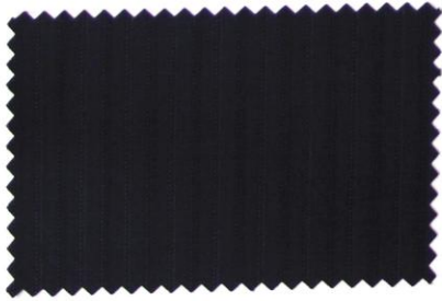
067-60 / 700 2% SILK 98% WOOL PRESTIGE 150 150 CM 260 G NAVY / SUIT