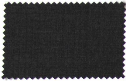
069-07 / 900 2% SILK 98% WOOL PRESTIGE 150 150 CM 240 G CHARCOAL / SUIT