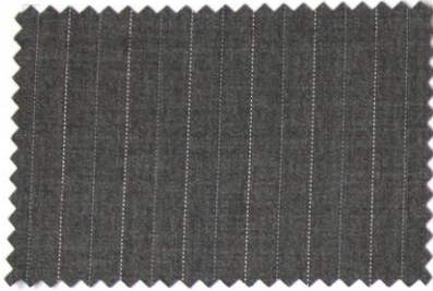
067-57 / 700 2% SILK 98% WOOL PRESTIGE 150 150 CM 260 G GREY / SUIT