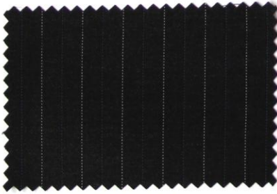
067-58 / 700 2% SILK 98% WOOL PRESTIGE 150 150 CM 260 G CHARCOAL / SUIT