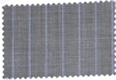
067-72 / 700 2% SILK 98% WOOL PRESTIGE 150 150 CM 260 G BLUE / SUIT