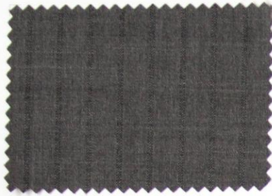
060-56 / 700 2% SILK 98% WOOL PRESTIGE 150 150 CM 260 G GREY / SUIT