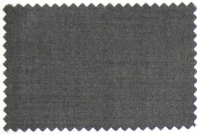
028-96 / 800 45% SILK 55% WOOL PRESTIGE 150 150 CM 260 G GREY / SUIT