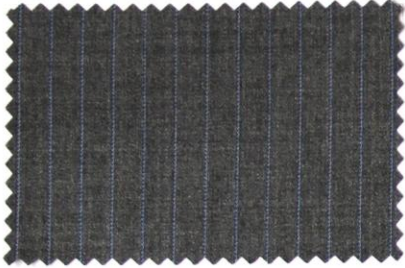
065-62 / 700 2% SILK 98% WOOL PRESTIGE 150 150 CM 260 G GREY / SUIT