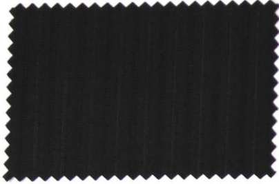
067-59 / 700 2% SILK 98% WOOL PRESTIGE 150 150 CM 260 G BLACK / SUIT