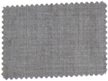
028-97 / 800 45% SILK 55% WOOL PRESTIGE 150 150 CM 260 G GREY / SUIT