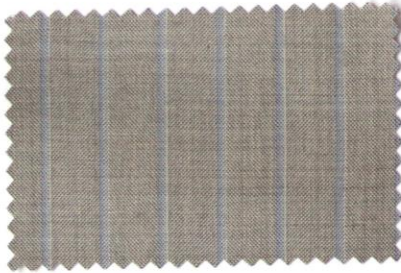
067-73 / 700 2% SILK 98% WOOL PRESTIGE 150 150 CM 260 G BEIGE / SUIT