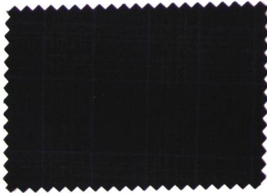
067-63 / 700 2% SILK 98% WOOL PRESTIGE 150 150 CM 260 G NAVY - SUIT