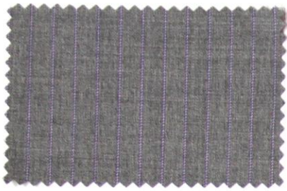
065-61 / 700 2% SILK 98% WOOL PRESTIGE 150 150 CM 260 G GREY / SUIT