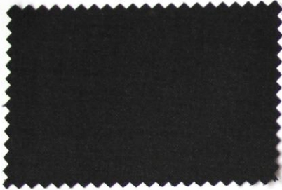
028-68 / 800 45% SILK 55% WOOL PRESTIGE 150 150 CM 260 G CHARCOAL / SUIT