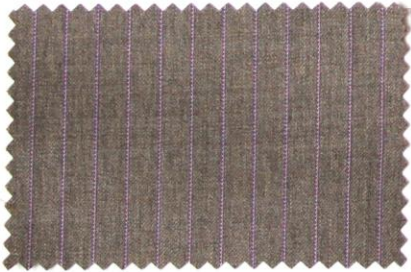
065-63 / 700 2% SILK 98% WOOL PRESTIGE 150 150 CM 260 G TAUPE / SUIT