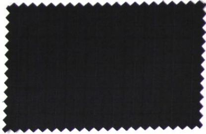
069-08 / 900 2% SILK 98% WOOL PRESTIGE 150 150 CM 240 G NAVY / SUIT