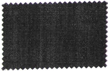
069-05 / 900 2% SILK 98% WOOL PRESTIGE 150 150 CM 240 G CHARCOAL / SUIT