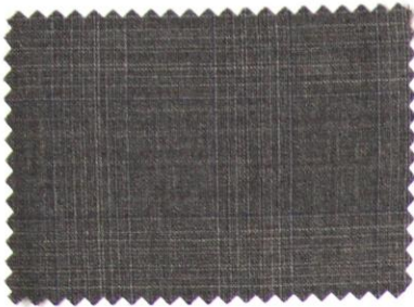
067-61 / 700 2% SILK 98% WOOL PRESTIGE 150 150 CM 260 G GREY - SUIT