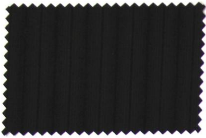
067-10 / 700 2% SILK 98% WOOL PRESTIGE 150 150 CM 260 G BLACK / SUIT