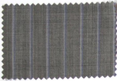
067-71 / 700 2% SILK 98% WOOL PRESTIGE 150 150 CM 260 G GREY / SUIT