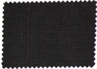
067-62 / 700 2% SILK 98% WOOL PRESTIGE 150 150 CM 260 G CHARCOAL - SUIT