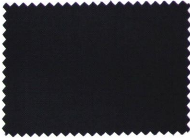
028-98 / 800 45% SILK 55% WOOL PRESTIGE 150 150 CM 260 G CHARCOAL / SUIT