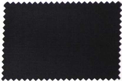
028-99 / 800 45% SILK 55% WOOL PRESTIGE 150 150 CM 260 G BLUE / SUIT