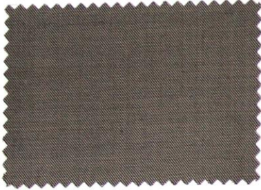
029-00 / 800 45% SILK 55% WOOL PRESTIGE 150 150 CM 260 G BROWN / SUIT