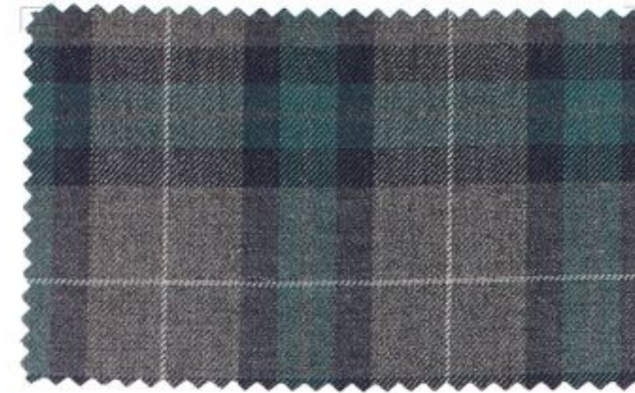
655 - 522 / 1200 100% Wool 150cm 250g Grey / Green / Blue