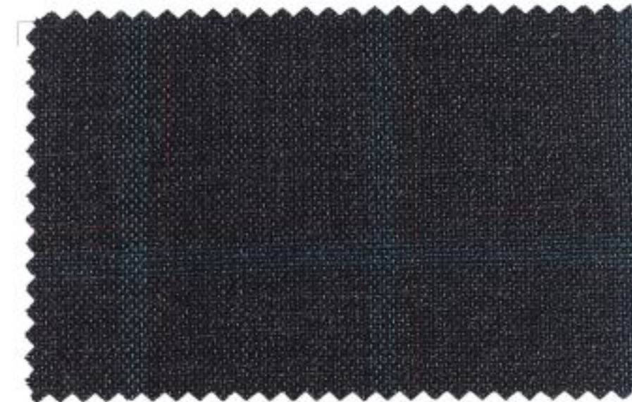
655 - 546 / 1200 100% Wool 150cm 230g Charcoal / Green Super 130's