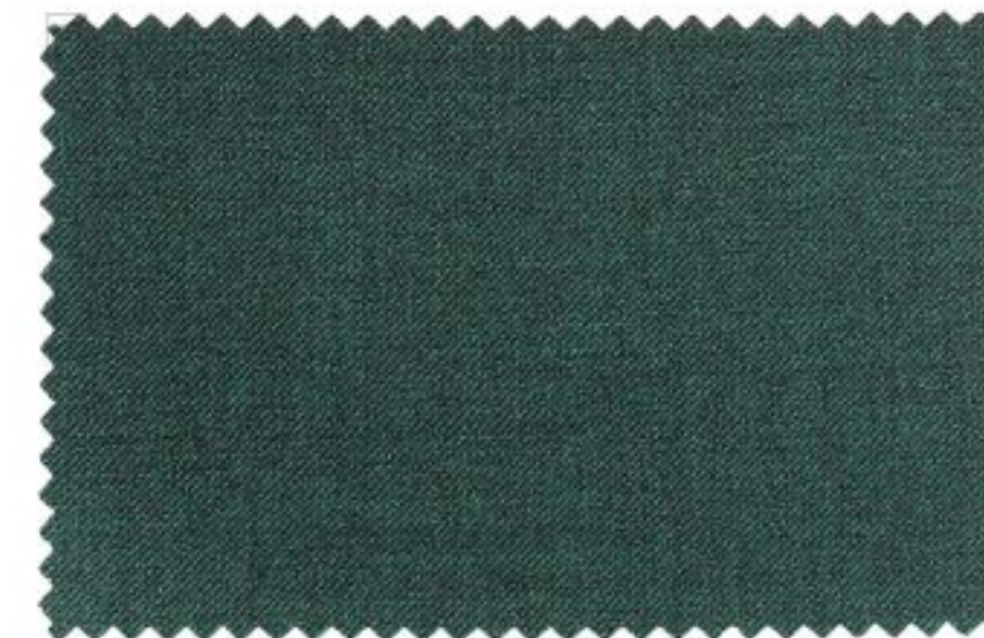
624 - 023 / 800 100% Wool 150cm 260g Green